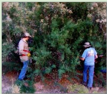
Two Scouts cut a large Tamarisk in Buckhorn Wash (above).