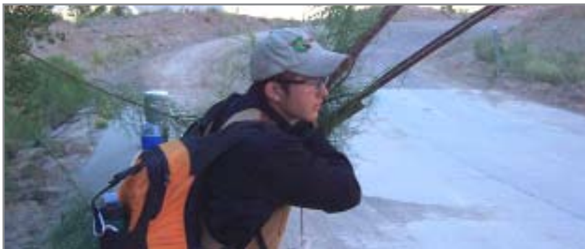
A Scout carries Tamarisk limbs from an infested site. (left). A mobile truck made chemical available to sprayers throughout the canyon (below).