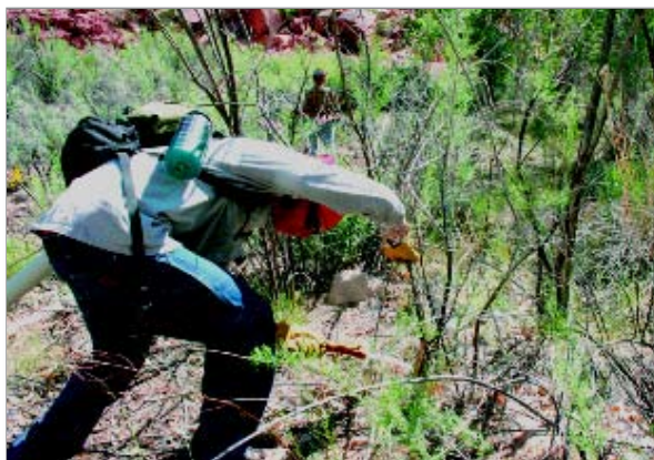
A Scout Arrowman attacks a thicket of Tamarisk (above).